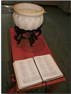
Worship at the Academy