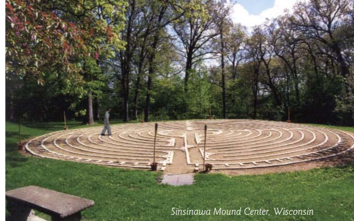
Sinsinawa Mound Center, Wisconsin

Over the course of the two years, this rhythm of gathering and returning home encourages participants to integrate what they are learning. The mantle of spiritual leadership comes as a joy and delight.