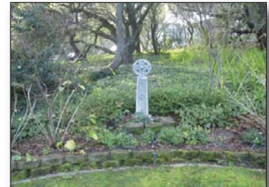
Mercy Center, California

Between sessions , participants covenant to deepen their spiritual lives through journaling, spiritual direction, directed readings and care of one's physical body. First and second year covenant commitments provide a focus for one's spiritual growth and a basis for one's engagement with the world.