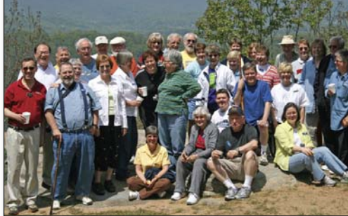
Academy Community in Alabama

Loving, spiritual guidance for the community is offered by the leadership team. These are persons who have completed the two-year Academy, and they are there for you as servant leaders. Two faculty presenters offer guidance at each session; they are authors, seminary professors, monks, spiritual directors and pastors, carefully chosen for both their knowledge and their wisdom.