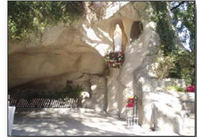
Oblate Renewal Center, San Antonio, TX