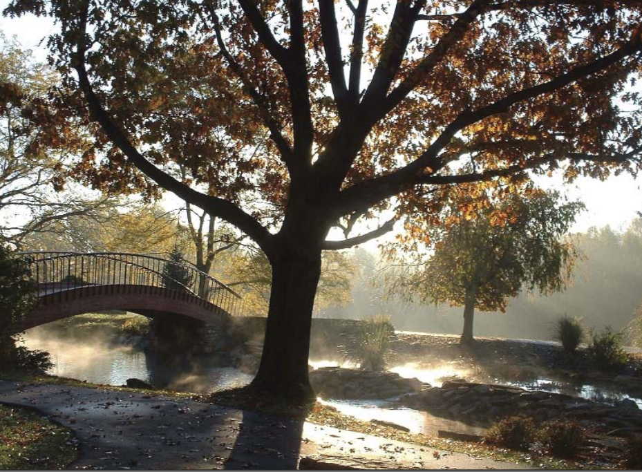
Bon Secours Retreat Center, Maryland