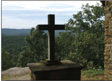
Sumatanga Conference Center, Alabama